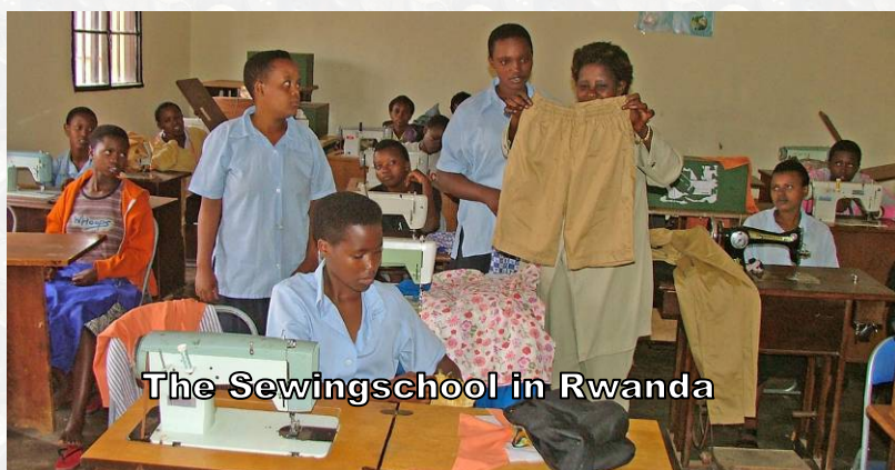
The Sewingschool in Rwanda