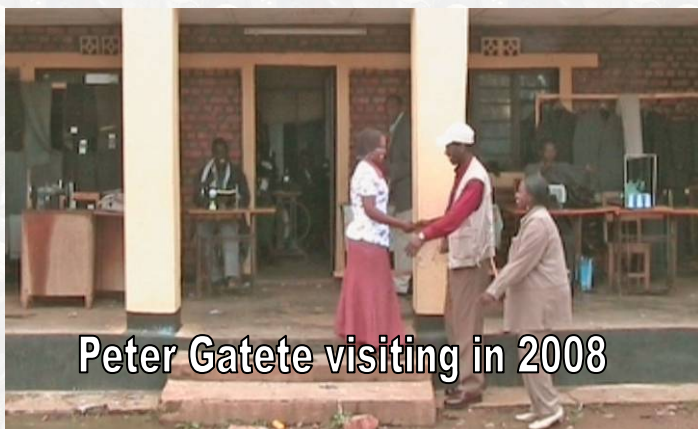
Peter Gatete visiting in 2008