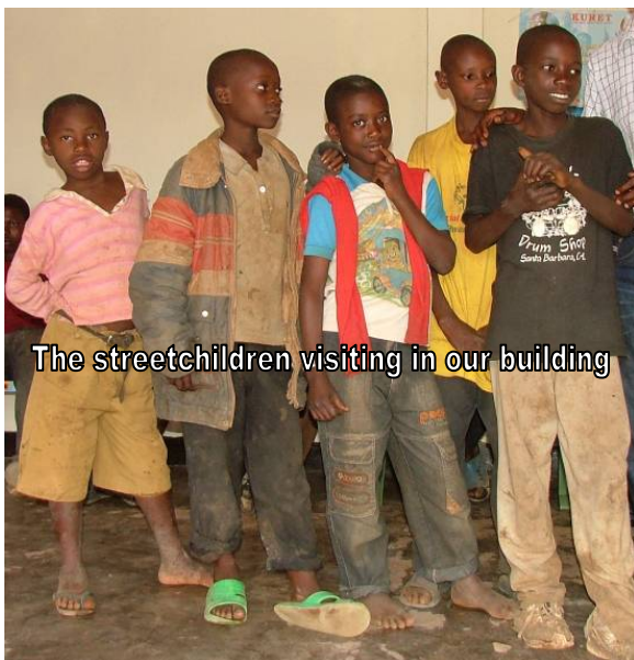
The streetchildren visiting in our building

To be able to reach the targeted goal of this project we want to involve society to help with the current state of the street children. We want to make them aware of their role in the improvement of the situation. This means that we will contact churches, the local governments, and whenever possible the families of each child.