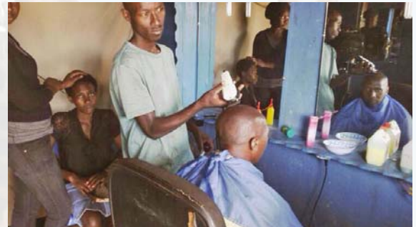
The Hair Salon Project

The Tailoring School is doing well; we could also give some graduated students whom did not get a sewing machine last year a sewing machine now so that they can earn a living on their own. We count on your support so we can buy a sewing machine for all students.