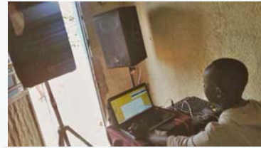
The Audio Rental Project

Five young men have gotten their driver license and we could pay for 5 more motorbikes so they can work as a motorbike Taxi and take care of themselves from now on. We want to thank Stichting voor-ontwikkelings-samenwerking K.O.O.K. for it and for sponsoring the Audio rental project.